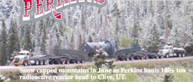
Snow capped mountains in June as Perkins hauls 100+ ton radioactive reactor head to Clive, UT.

“Elvis has left the building”—another radioactive reactor head leaves a Midwest power plant bound for burial in UT. Perkins has safely delivered 10 radioactive superloads to UT in the past year.