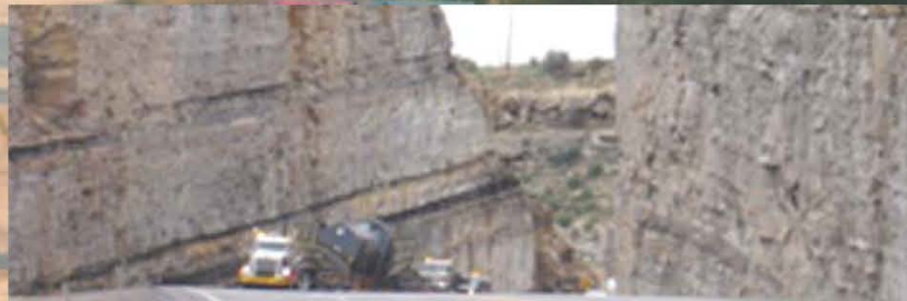
1150 Horsepower: A pair of Perkins heavy tractors make steady progress up the 8% grade at the Flaming Gorge in UT.