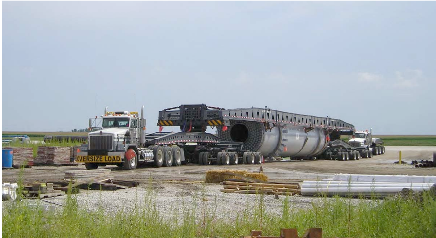
The 257,000-pound Rotary Dryer arrives on site at a new Ethanol Plant site in IA.

The first of several large Rotary Dryers was successfully delivered by Perkins Specialized Transportation Contracting from a fabrication shop in WI to a new Ethanol Plant located in the corn country of rural IA. It took months of planning and route surveys, dozens of hauling permits and some very specialized highway transport equipment to deliver the 73' long drum, which was nearly 14' wide.